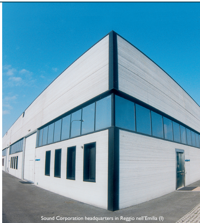
Sound Corporation headquarters in Reggio nell'Emilia (I)

LSA (Linear Source Array) is the prime product of the entire range. Other than possessing an excellent high-class sound pressure, the upper module XTLSA model has, in particular, an innovative mid-horn-loaded setting. Moreover MISI™ (Middle-Sized Line Array) has been created to achieve a sound pressure of very near approximation to the fore-said "bigger" system, but of superior