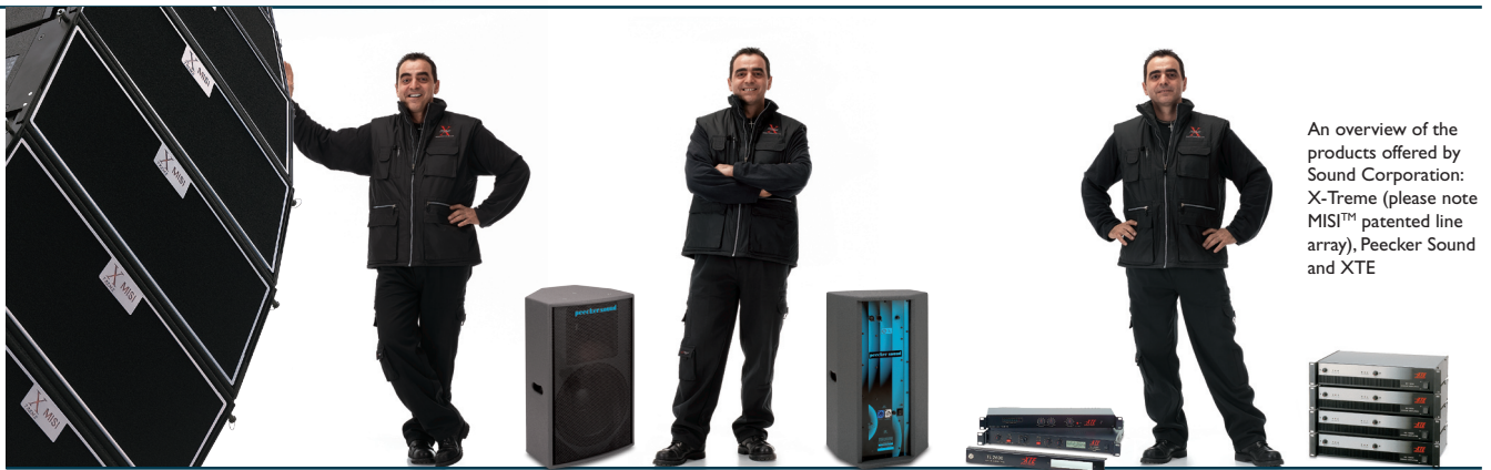
An overview of the products offered by Sound Corporation: X-Treme (please note MISA™ patented line array), Peecker Sound and XTE